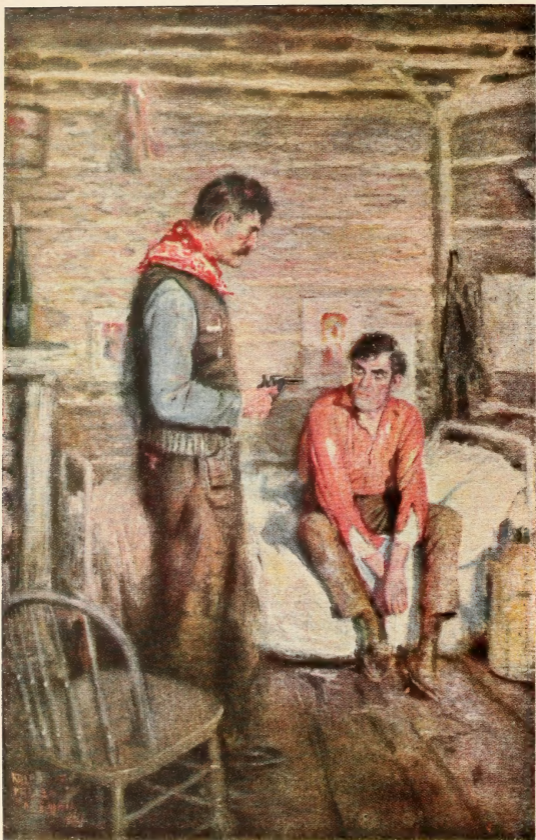
"His blazing black eyes stared into the gaze of Ross"